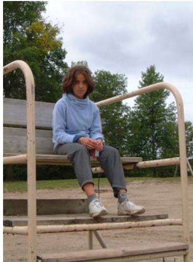
The big, comfy, wooden chair??

on the lifeguard's tower was great - and it shows off her new haircut!