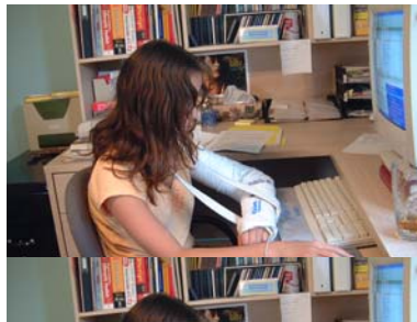
Hooray for keyboard drawers!

on, but once that was done she was back in business.