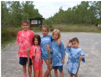
Off we go!

year was Messy Day - the name says it all, doesn't it? Another day the kids made tie-die shirts and off we went to Presqu'ile Park for a picnic and hike - where we saw 4 or 5 deer wandering the forest.