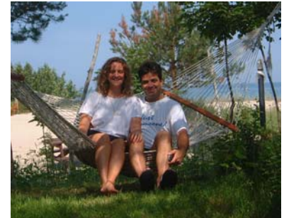
Relaxing at the Cancelli beach

Quotes: "I love learning, but I hate being taught." - Winston Churchill "Education is not the filling of a bucket, but the lighting of a fire." - William Butler Yeats