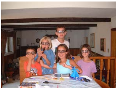
Harry Potters everywhere!

The surprise hit of this year was Harry Potter Day! All the kids were enrolled at Hogwarts for the day and attended Transfiguration, Quidditch, and Potions classes, along with a field trip to Hogsmeade (okay ... Wal-Mart) for supplies, and of course, a tall glass of butter-beer! The sorting hat ceremony was lots of fun and each house earned enough points that day to be awarded their own House Cup. That evening the parents also came to attend the End-of-Year Feast and celebrate the end of another wonderful summer - and to finally take them all home!