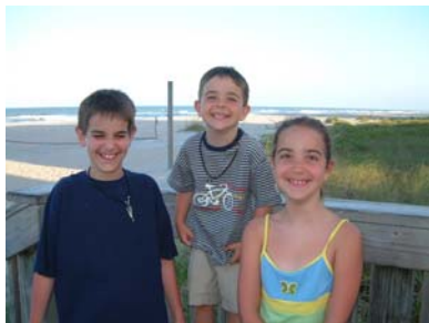
The kids at Cocoa Beach

In May we took a weeklong getaway and drove to Cocoa Beach, Florida. One of the many benefits of homeschooling is you can travel when the crowds are light!