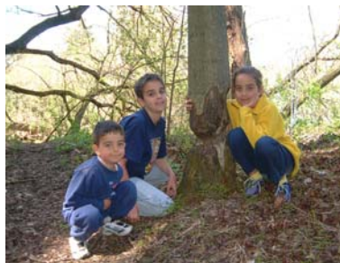
Beaver evidence at Boyd

Boyd Park has also played host to a number of hikes, as well as discoveries!